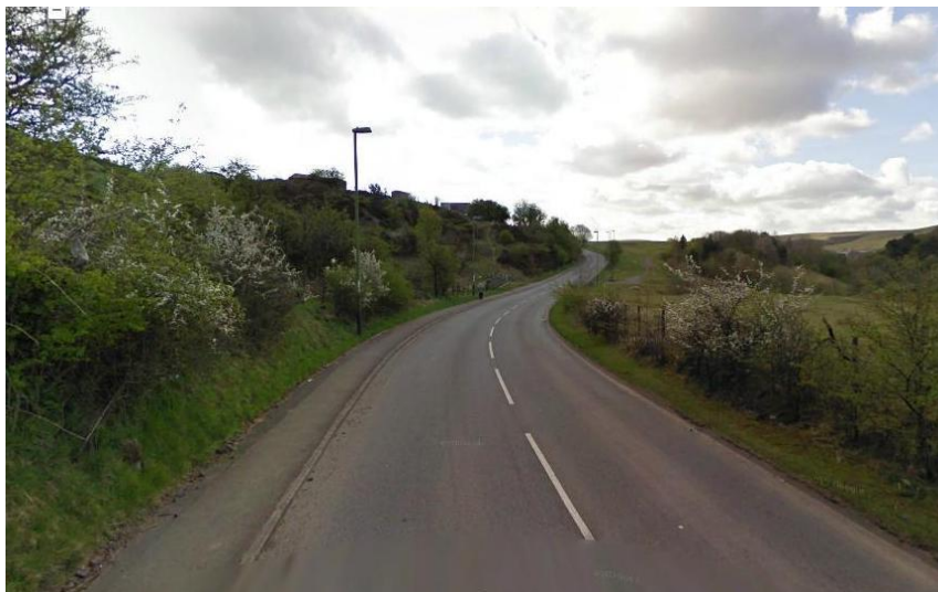
Southbound view along carriageway that connects Llechryd to Rhymney

The link is located in a relatively rural location with hardly any adjacent development and connects Llechryd village to Rhymney town. The carriageway is of good width and bends and undulates on occasions. There are very few junction access points other than the entrance to the Rhymney House Hotel. A footway is located next to the southbound lane and the whole of the link contains street lighting.