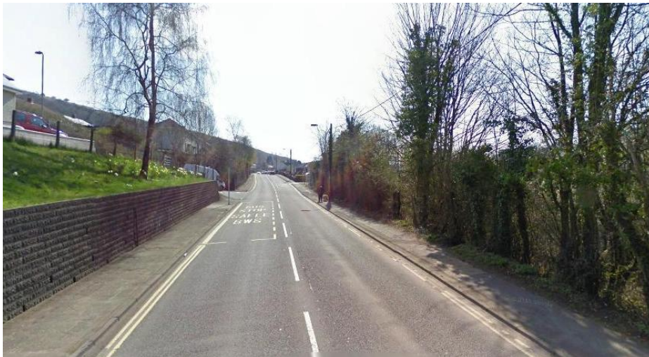
Eastbound view through Abertridwr

A single fairly straight carriageway road that's based in a residential location where there is a mixture of bungalows and terraced houses. The northern side of the link includes double yellow lines on both sides of the carriageway, and even when these lines come to an end there are hardly any parked vehicles, as most residents park towards the rear of their bungalows. It is here towards the north of the link where the speed and volume data was collected. However towards the south of the link the double yellow lines are generally located on one side of the road and the many terraced houses have no rear lanes. Consequently there are many more vehicles parked on the road. There are footways on both sides of the road and overall the link has good sight lines.