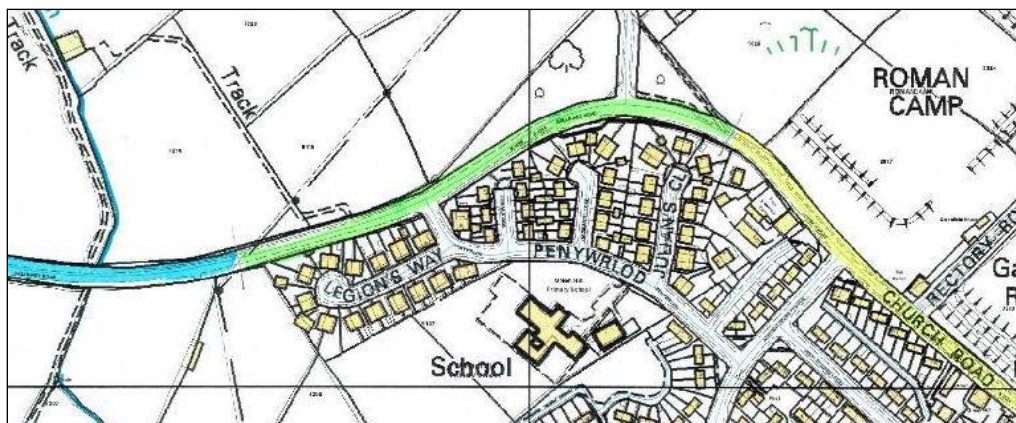
Proposed layout of Gelligaer Speed Limits