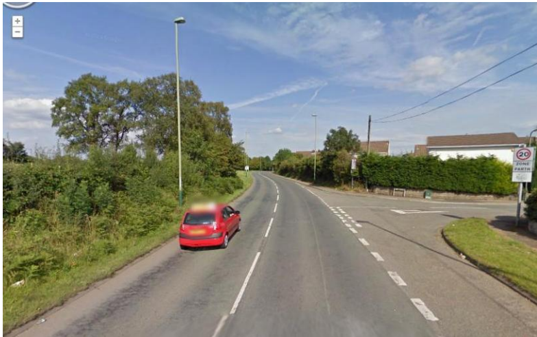
Eastbound view on approach towards Gelligaer village