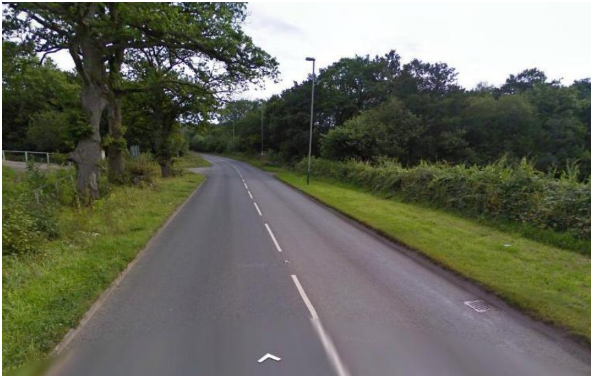
Eastbound view along Gelligaer Road

The link is located in a rural environment with no adjacent developments or footways along the length of the route. To the west of the link is a 30mph road that passes by Llancaiach Fawr and continues on to the CCBC boundary, whilst to the east of the link is a national speed limit section. Overall the carriageway is relatively wide and its characteristics are similar to a national speed limit road rather than a 40mph road. The carriageway is relatively straight for the majority of the route, however it does contain one sharp bend where the carriageway begins to rise in elevation. Just before this bend is a side junction access to 'Coed Top Hill Reed Facility' which has poor visibility when leaving the site onto the main highway. There are no other side junctions other than the access to Coed Top Hill Reed facility.