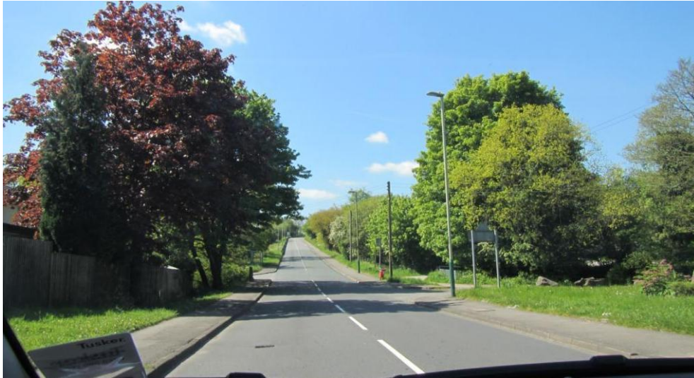
Westbound view between Penpedairheol and Gelligaer

Speed management measures will need to be considered to address the high traffic speeds along the route.