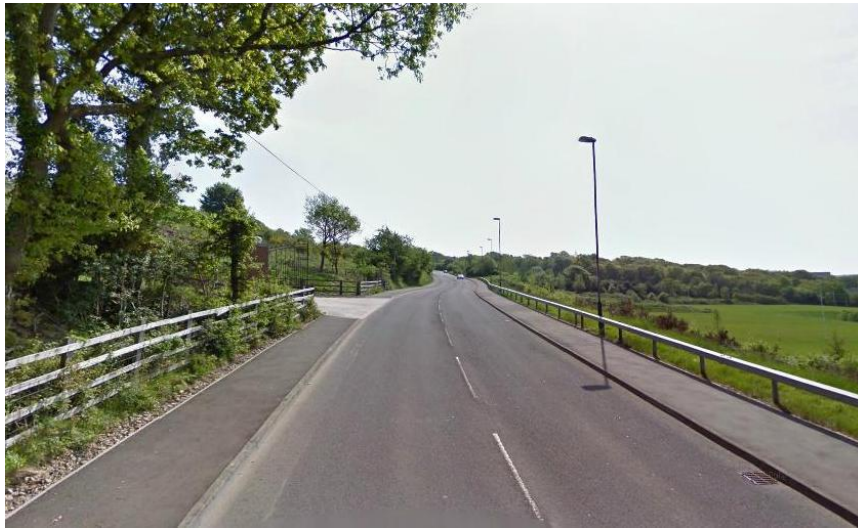
Uphill route along Oak Terrace By-pass