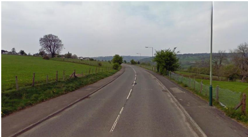
Rural road connecting the residential areas along Abernant Road and Penylan Road

The link passes by Markham village and can be split into two sections either side of the mini roundabout. To the west along Pantycefn Road are several bungalows, Markham primary school and a few side junction accesses. Traffic speeds are well controlled along this section with a several speed humps and builds outs that narrow the width of the road. However to the east of the mini roundabout along Abernant Road the carriageway is of good width, there are no speed reducing features and the residential properties are only located on one side of the road. The residential properties end some 400m before the end of the speed link. From here onwards the environment is very rural, as can be seen in the picture below, and it was along this section that the data was gathered.