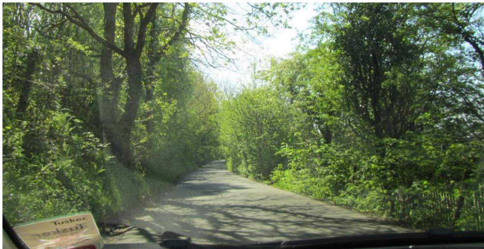
Southbound view along Victoria Road